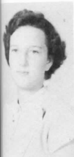
First Vice President