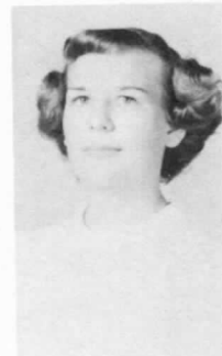
Second Vice President