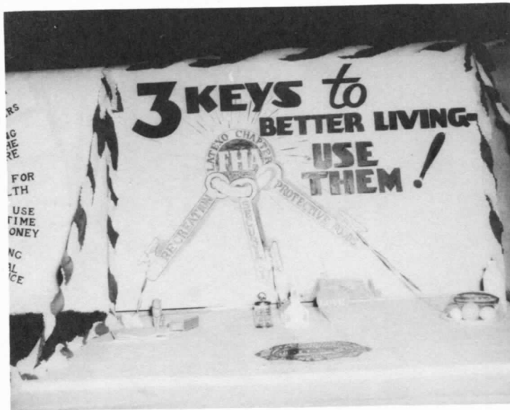
County Fair Exhibit